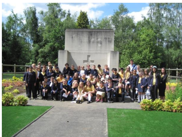
The group at the Chelsea Pensioner's Memorial