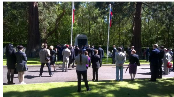
The scene at the wreath laying

Two Czechoslovak RAF veterans attended with the press, staff of Brookwood Cemetery and many well wishers