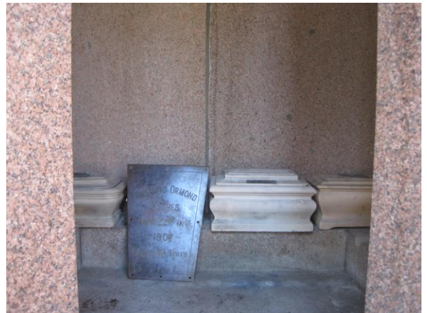
The interior of the Hughes Mausoleum including the metal plaque