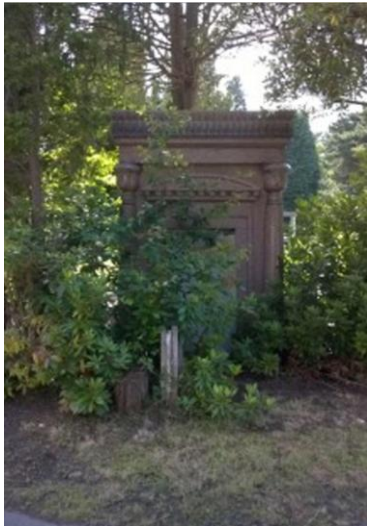
The Hughes Mausoleum before and after the clearance work