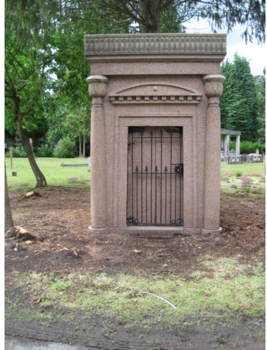
The Hughes Mausoleum with the Wrought Iron Gates