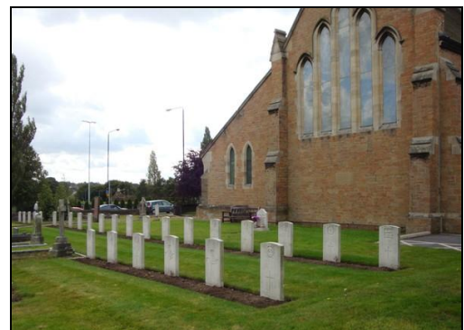
The war graves at St Alban's Church Forest Town, Mansfield