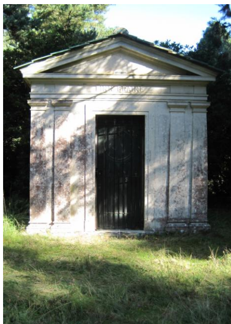
The Braine Mausoleum with the new gates

There is only one interment in the mausoleum in a coffin encased in marble; the remains of Fanny Robinson Braine who died in 1934.