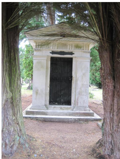
The Normand Mausoleum with the new wrought iron gates