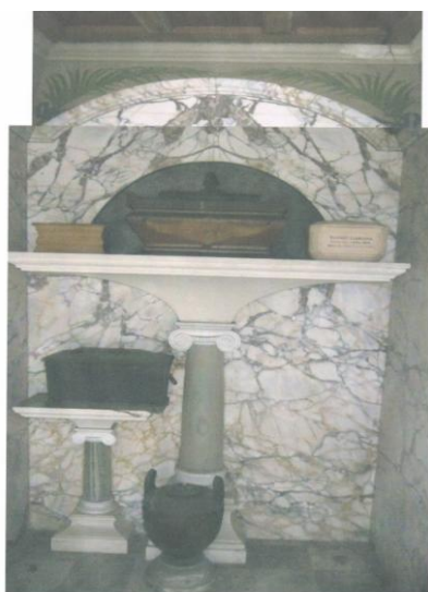
The inside of the Normand Mausoleum