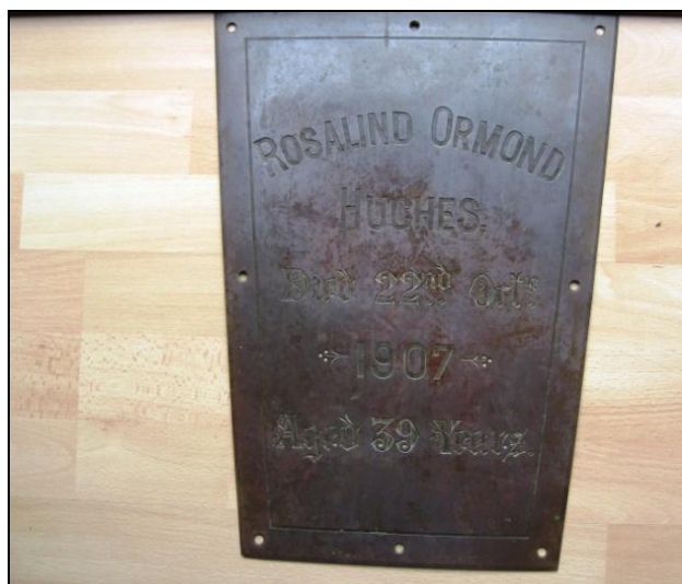
The plaque found outside the Hughes Mausoleum