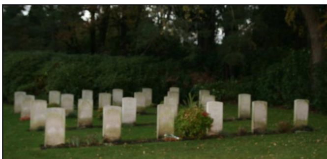
The Muslim Graves at Brookwood Military Cemetery