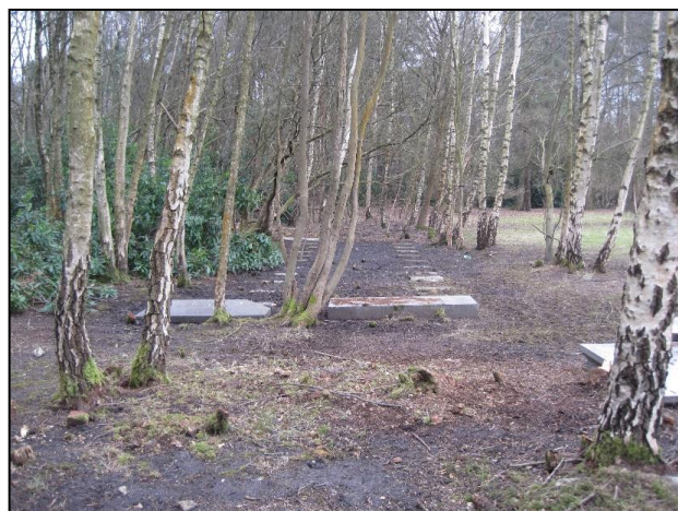
A view of Plot 57a

Other memorials have sadly been deposited in a disorderly heap near the front of the area; in this heap there are good examples of granite crosses and two grey granite chest tombs. On some stones, inscriptions are visible and these are being recorded.